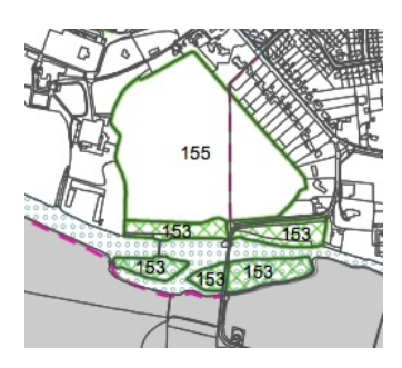
Plan 6: Land North of the River